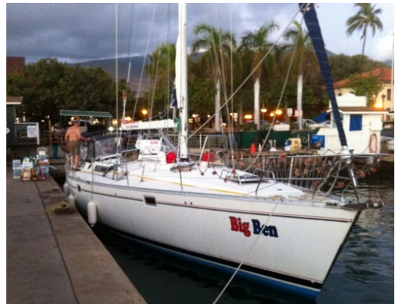
Above: Big Ben in Lahaina, Hawaii at the completion of the Vic-Maui Yacht Race.