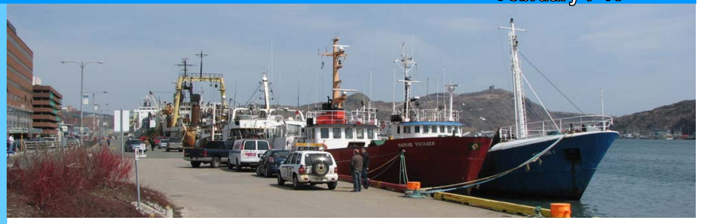
"'Morramorinbeafinemorin" Or How to become an Honorary Newfoundlander!!

I hopped on the red-eye out of Vancouver on October 24, 2300hrs, already tired from an early start to my day. 14 hours and 5 time zones later, I touched down in beautiful St. John's, Newfoundland, even more tired, and trying to figure out what language these folks were speaking! Friendly, even more so than their reputation indicates, but REALLY difficult to understand. No worries, I thought...I speak rum fluently...how difficult can this be?